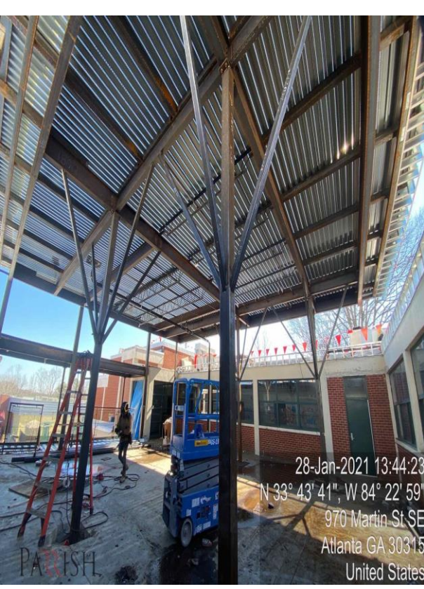
Decorative Structural Steel