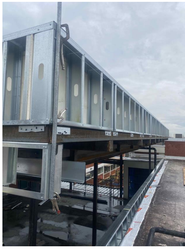
Media Center Parapet